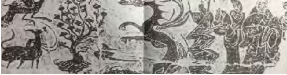
Figure 1: Paper rubbing of the Magic Tree from a Han Dynasty era stone carving

In this chapter, we will introduce some background information and stress the basic principles that will bring context to XiangShu 象數, the symbolism and numerology of each Heavenly Stem and Earthly Branch. Please take your time to review this section before moving on to the rest of the book.