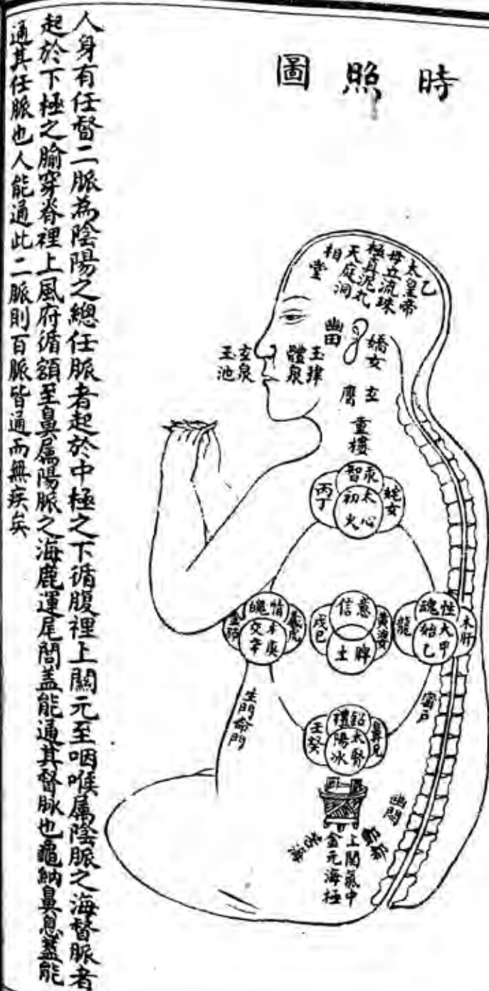
ShiZhaoTu 時照圖 Illumination Timing Diagram

人之元氣逐日發生子時復氣到尾閭丑時臨氣到背堂寅時泰氣到玄樞卯時大壯氣到夾脊辰時夬氣到陶道巳時乾氣到玉枕午時姤氣到泥丸未時遯氣到明堂申時否氣到臚中酉時觀氣到中浣戌時剝氣到乾闥亥時坤氣而歸於氣海矣