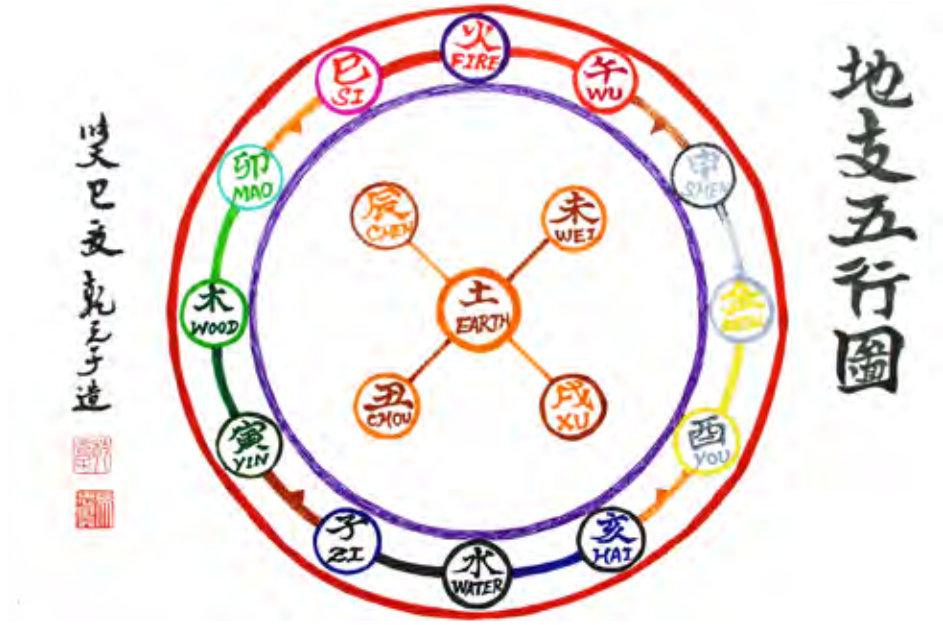
Figure 18: Earthly Branches Five Elements Diagram

The twelve Earthly Branches are grouped into YinYang pairs of Elements—Yin 寅 and Mao are Wood; Si and Wu 午 are Fire; Chen, Xü, Chou, and Wei are Earth; Shen and You are Metal; and Hai and Zi are Water.