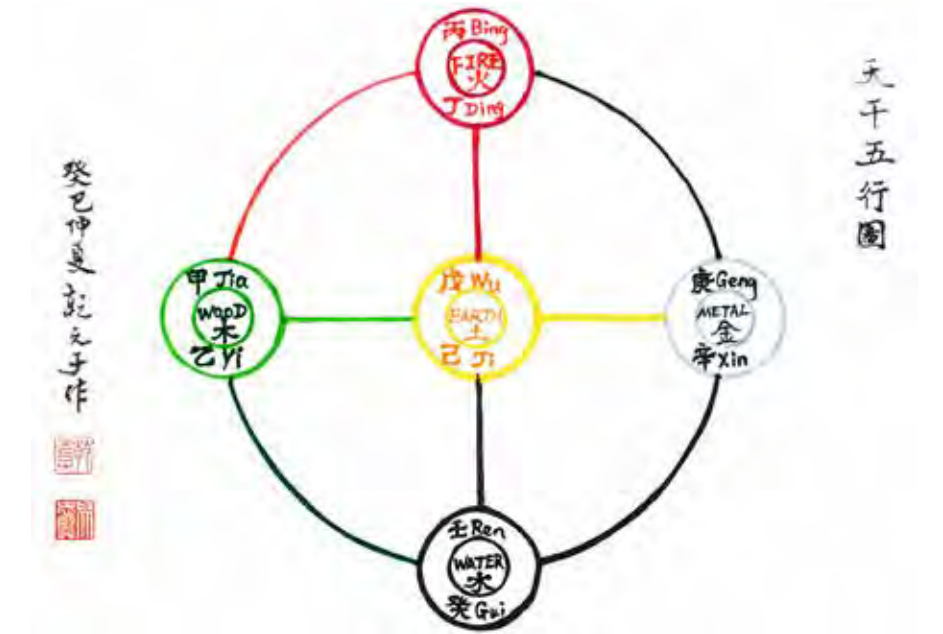
Figure 17: Heavenly Stems Five Elements Diagram

The twelve Earthly Branches are grouped into YinYang pairs of Elements—Yin 寅 and Mao are Wood; Si and Wu 午 are Fire; Chen, Xü, Chou, and Wei are Earth; Shen and You are Metal; and Hai and Zi are Water.