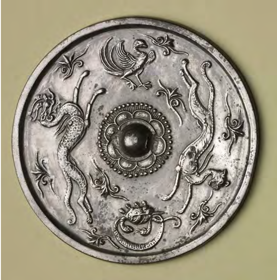
Figure 12: Tang Dynasty bronze mirror with four spiritual animals

Given that the Xiu mark the daily position of the Moon during its monthly orbit around Earth, we find that the Moon resides in a different Lunar Mansion each night. Chinese astronomers observed each quadrant of the sky (found in the four cardinal directions) and found that every seven Mansions form a clear pattern—that of a spiritual animal.