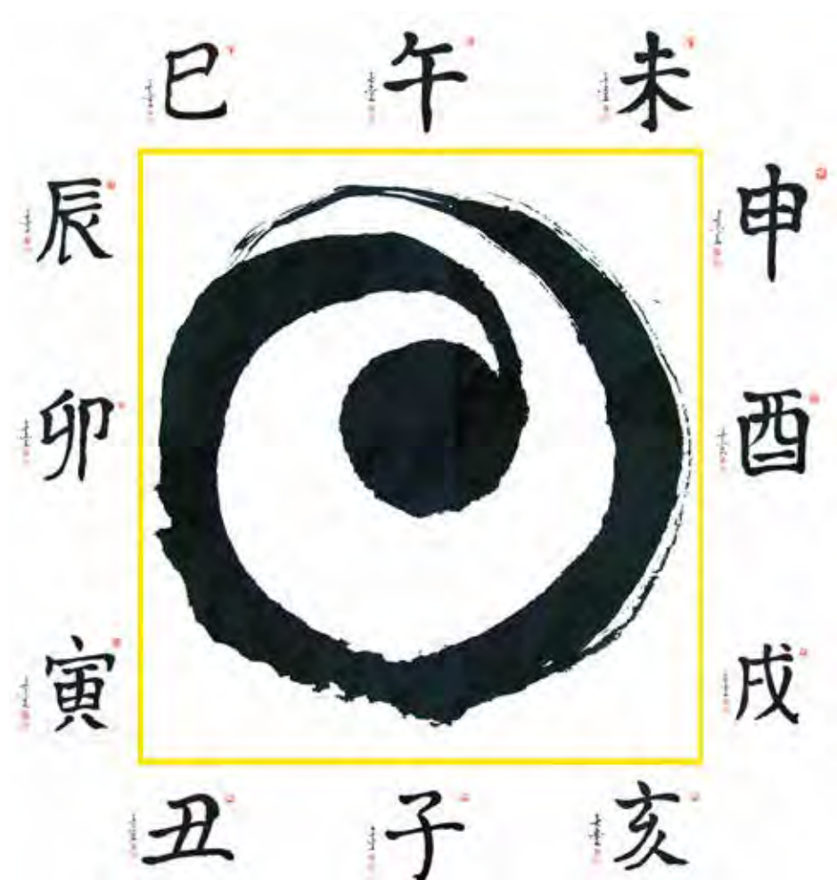
Figure 4: The Earthly Way of DiZhi

Similar to TianGan , DiZhi is a Chinese term that contains a collection of twelve specific Chinese characters: Zi 子, Chou 丑, Yin 寅, Mao 卯, Chen 辰, Si 巳, Wu 午, Wei 未, Shen 申, You 酉, Xu 戌, and Hai 亥. DiZhi represents DiDao 地道, the Way of Earth. DiDao means square, corner, stable, solid, keeping still, and without movement.